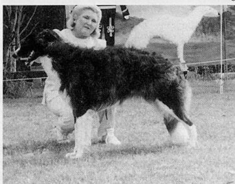
Puppy Dog Clovelly Another Rebel *09/10/97

By next day most of the delegates had arrived and it was good to meet up with old friends. A number of the visitors had judging appointments while in Australia, and now it was the turn of Liz Whitehead (Tazeb, U.K.) to judge at the Borzoi Club of NSW Ch. Show. Very reluctantly I forced myself to stay away so that all the dogs would be new to me for my own judging appointment the following day. A trip to a local shopping mall was some compensation, especially when we realised how favourably the prices compared with England, so we made quite a few purchases despite the fact that our luggage was already well over weight. Our prayers for good weather were answered with a perfect spring day for the I. B.C. show held in conjunction with the Hound Club of N.S.W. Houndfeste. I was particularly glad of this as the previous day had been uncomfortably hot, so I arrived at the showground complete with a hat, which luckily was superfluous. The day started with children in Russian costume